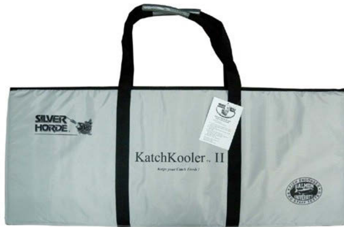
Katch Kooler II Sale Price $29.95 Reg. Price $39.95