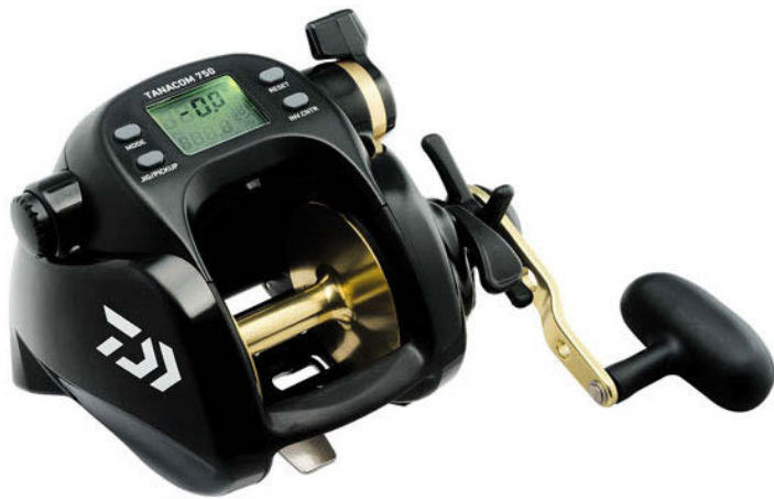
Daiwa Tanacom 750 Sale Price $549 Filled Free w/65lb-80lb Braided Line