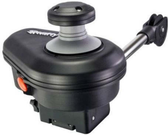
Scotty 2500 Pot Puller Price $399.00 Reg. Price $499