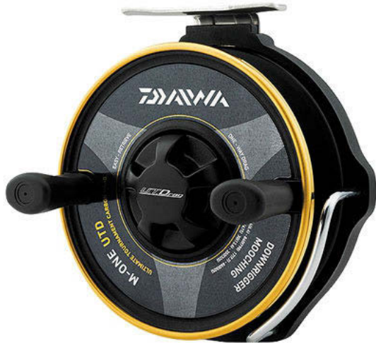
Daiwa M-One Mooching Reel $59.95 Reg. Price $79.50