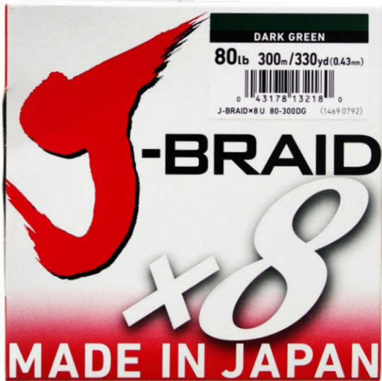
Daiwa J Braid 65lb & 80lb 65lb-$19.95 80lb $23.50 330 yard spool