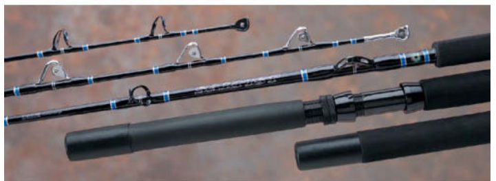
Daiwa Seagate SGT60XHR-RS Halibut Rod $69.95 Reg. Price $79.50

No Coupons or Discount Gift Certificates can be Used on these On-Sale Items