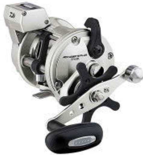
Daiwa ACCUDEPTH 27LCB Right/Left Hand $69 w/free line Reg. Price w/line $81