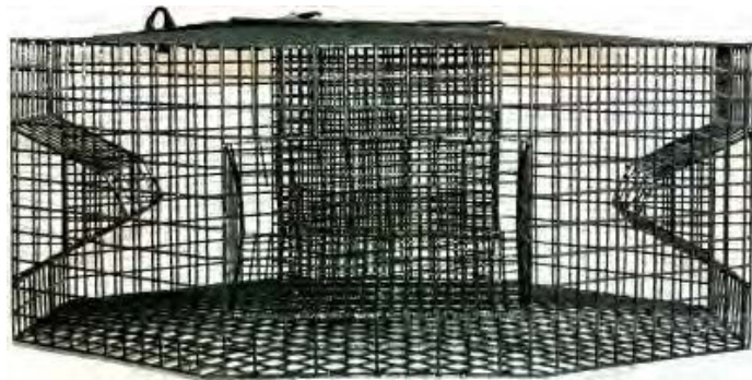
SMI 19027 Sale Price $79.50 McKay Style Pot Reg. Price $99.50