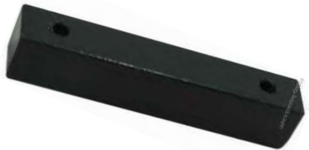
SMI 5lb Shrimp Pot Weight Price $11 Reg. price $17.95

These prices Cannot be used in combination with Coupons