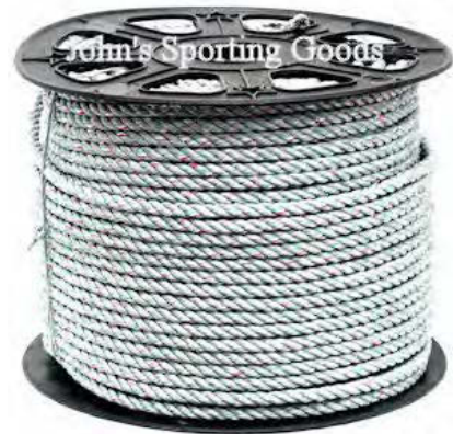
1/4" Leaded Rope Sale Price $38 600ft Leaded Rope Reg. Price $48