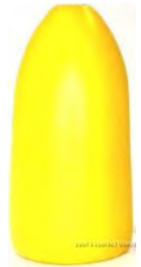
SMI 19022 Sale Price $99.00 Shrimp Pot, 400ft Leaded Rope, Yellow Buoy Reg. Price $125.40

In Store Pick Up Only on These Sale Prices