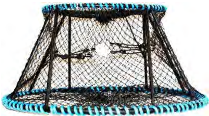
Ladner Style Shrimp Pot Medium Size $79 Large Size $89 Reg. Price $89-$119