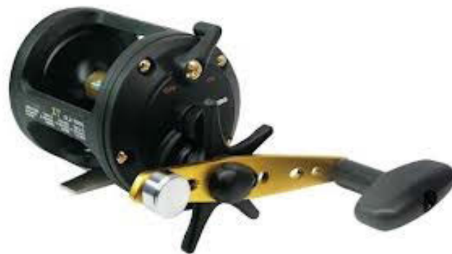
Okuma CLX 300 Salmon Reel Sale Price $29.50 Reg. Price $39.50