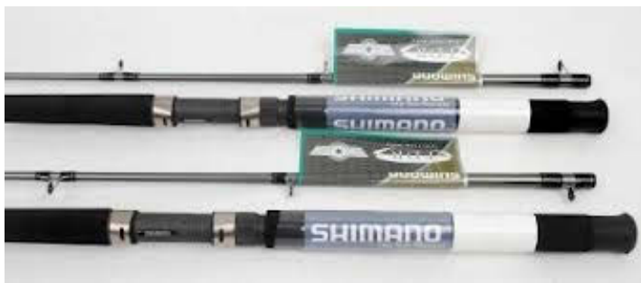
Shimano TDR Salmon Rod Sale Price $23.50 Reg. Price $29.95