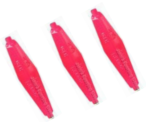
2.0 & 2.5 Hot Pink Buzz Bomb Sale Price $2.75 each Reg. Price $4.95