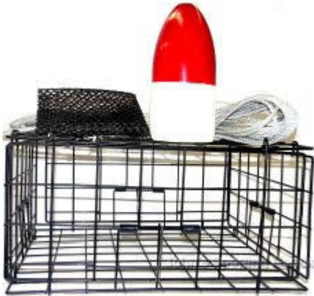
FTCC Crab Pot Complete Crab Pot, Bait Bag, Buoy, 100ft Leaded Rope, Crab Measure Sale Price $39.95