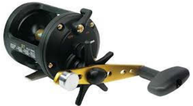
Okuma CLX 300 Salmon Reel Sale Price $29.50 Reg. Price $39.50

Prices Good Through July 30th-In Store Purchase Only