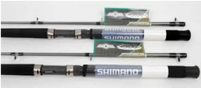
Shimano TDR Salmon Rod $23.50 Reg. Price $29.95