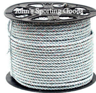
600ft 1/4" Leaded Rope Special Price $39.95 Reg. Price $59.95