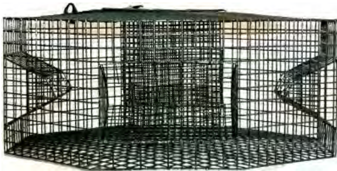
SMI 19027 Sale Price $79.50 McKay Style Pot Reg. Price $99.50