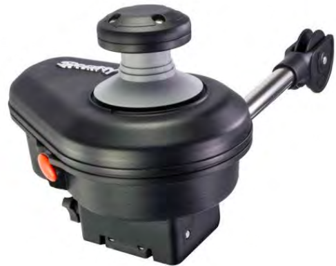
Scotty 2500 Shrimp Pot Puller Price $449

These prices are for in store purchases only