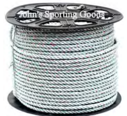
SMI 19022 Sale Price $99.00 Shrimp Pot, 400ft Leaded Rope, Yellow Buoy Reg. Price $125.40