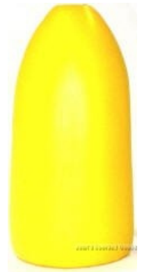
SMI 19022 Sale Price $99.00 Shrimp Pot, 400ft Ledged Rope, Yellow Buoy Reg. Price $125.40

Check Out Dimensions and Weights of these Shrimp Pots: Click Here