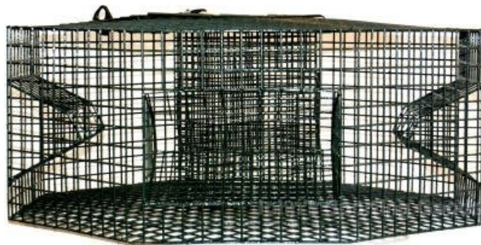
SMI 19027 Sale Price $79.50 McKay Style Pot Reg. Price $99.50