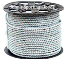
SMI 19022 Sale Price $99.00 Shrimp Pot, 400ft Leaded Rope, Yellow Buoy Reg. Price $125.40