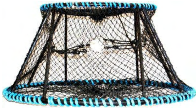
Ladner Style Shrimp Pot Medium Size $75 Large Size $89 Reg. Price $89-$119