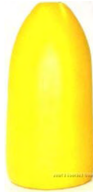
SMI 11"X5" Yellow Buoys 3 Buoys $9.95 Reg. Price $23.85

Check Out Dimensions and Weights of these Shrimp Pots: Click Here