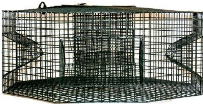
SMI 19027 Sale Price $78.50 McKay Style Pot Reg. Price $99.50