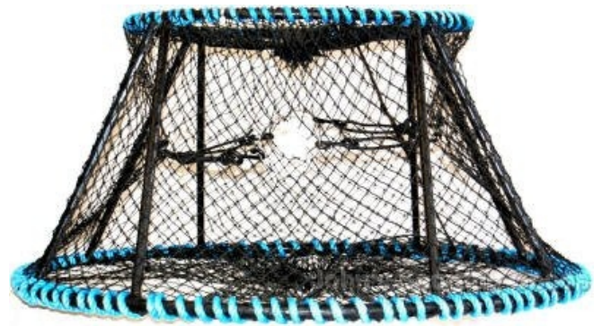
KUFA CT-150 Sale Price $89.00 Ladner Style Pot Reg Price $119.00

Check Out Dimensions and Weights of these Shrimp Pots: Click Here