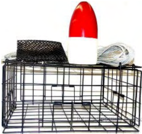
FTCC Crab Pot Complete Crab Pot, Bait Bag, Buoy, 100ft Leaded Rope, Crab Measure Sale Price $39.95