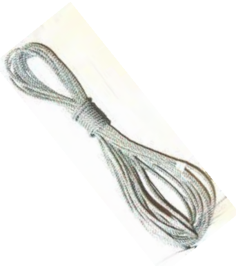
100ft Leaded 5/16'' Rope $9.95 Reg. Price $11.95