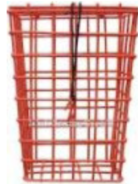
Wire Bait Box Sale Price $1.99 Reg. Price $5.95