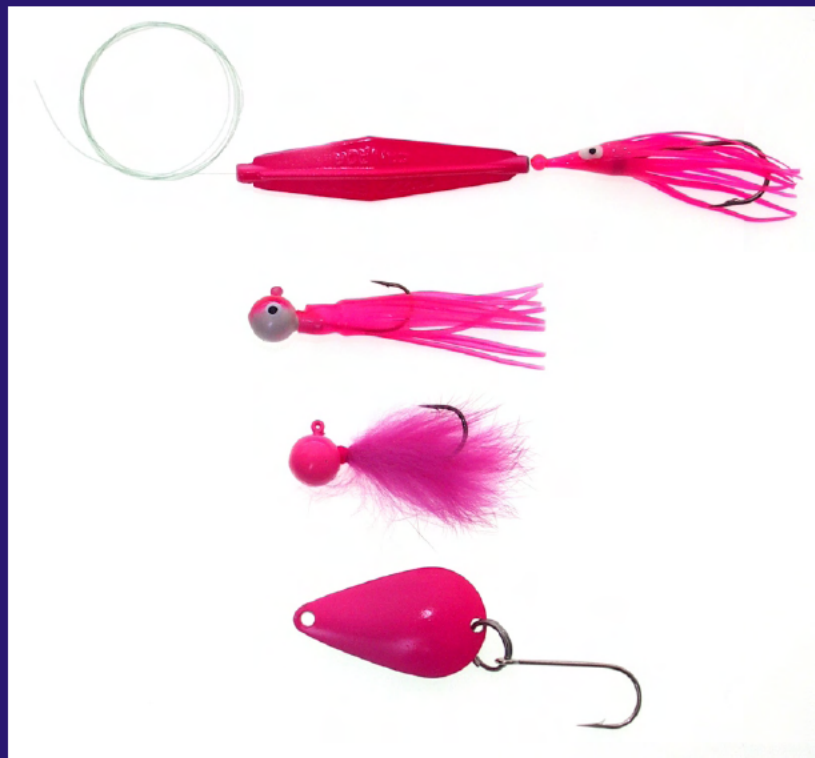
Top: 2 1/2" Pink Buzz Bomb rigged with an F-15 Mini Sardine Next: 1/4 ounce pink squid jig Next: 1/4 ounce pink marabou jig Bottom: 1/2 ounce pink spoon