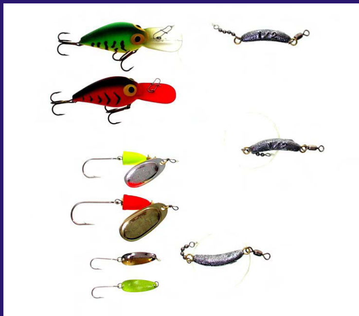
Top: Storm Wiggle Wart Plug #V74 Fire Tiger rigged with 6' leader to an 1/2 ounce weight Next: Storm Wiggle Wart #V90 Red Herring Bone Plug rigged with 6' leader to an 1/2 ounce weight Next: #3 Super Vibrax Chartreuse Spinner rigged with a 6' leader to a 1/2 ounce weight Next: #4 Super Vibrax Flo. Red Spinner, rig the same as above Vibrax Spinner Next: #1 Dic Nite Spoon 50/50 rigged with a 6' leader to a 1/2 ounce weight Next: #1 Dic Nite Spoon Chartreuse, rig same as above Dic Nite Spoon

Notice: All these lures must be rigged with single hooks to fish the Snohomish River